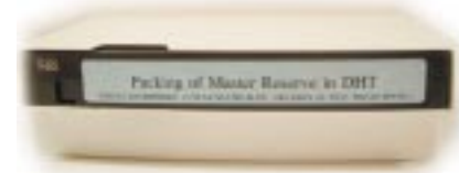
Master Reserve Packing Video PN 570061 $14.00

Training to pack a Strong Dual Hawk Tandem or renewing your packing procedures has just gotten easier. Here are the details: