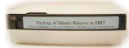
Master Reserve Packing Video PN 570061 $14.00

Training to pack a Strong Dual Hawk Tandem or renewing your packing procedures has just gotten easier. Here are the details: